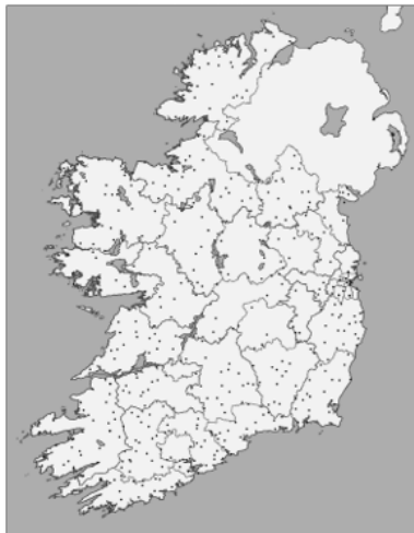
Map of Met Éireann meteorological stations

Note: lines denote the 2016 General election constituencies' boundaries